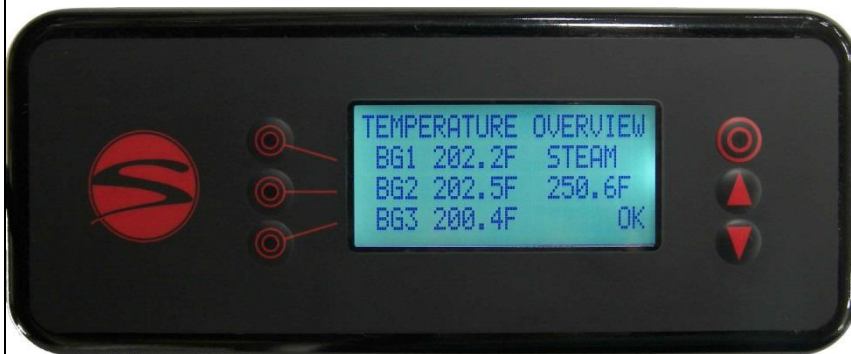
New Part # 2.3729 Complete Display Controller Assembly with Round Cable